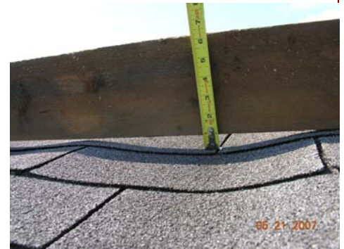
Example of collapsing roof sheathing due to moisture induced wood rot above a cathedral style ceiling.

At the end of the day we vote for the free flow of air as the best and easiest way to prevent a whole host of moisture related problems that can occur almost anywhere in a building structure, be it crawl space, walls or attics.